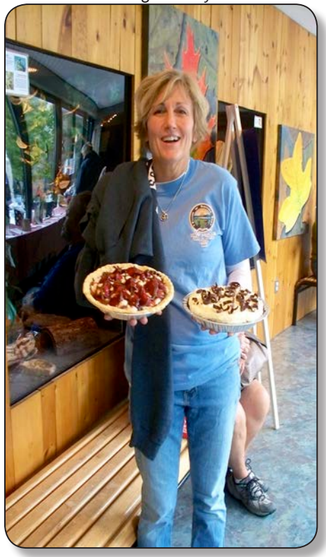
Pie contest at Sheffield Village Family ArtsFest

Other shows highlighted Australian wildlife, native fish and aquatic invertebrates, and ocean life, all with hands-on exhibits.