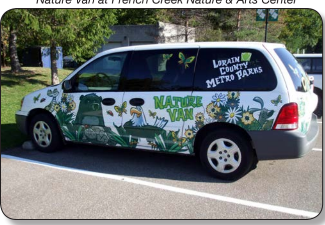
Nature Van at French Creek Nature & Arts Center

areas, reservable classrooms, and a non-lending nature library. The center also boasted a large gallery for hosting temporary exhibits.