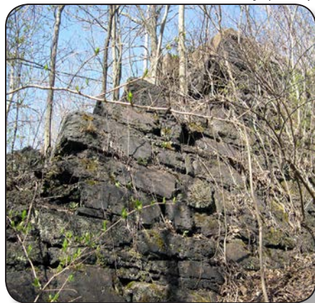
Retention wall for 1913 causeway (2008)