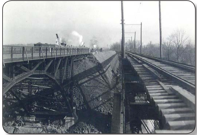
Steel arches of 1913 viaduct bridge