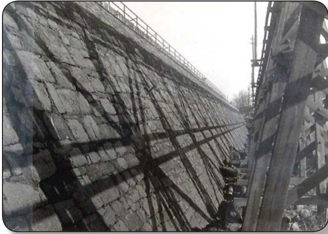
Causeway for 1913 viaduct bridge