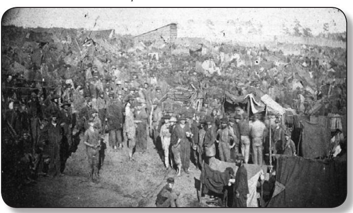
Federal prisoners at Andersonville

guilty and hung in Washington, D.C. on November 10, 1865 in sight of the Capitol Building—the only Confederate officer to be hung for war crimes.