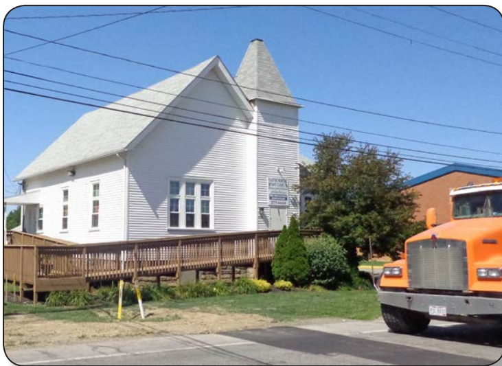
Faith House Day Care Center adjacent to Vincent School (2014)