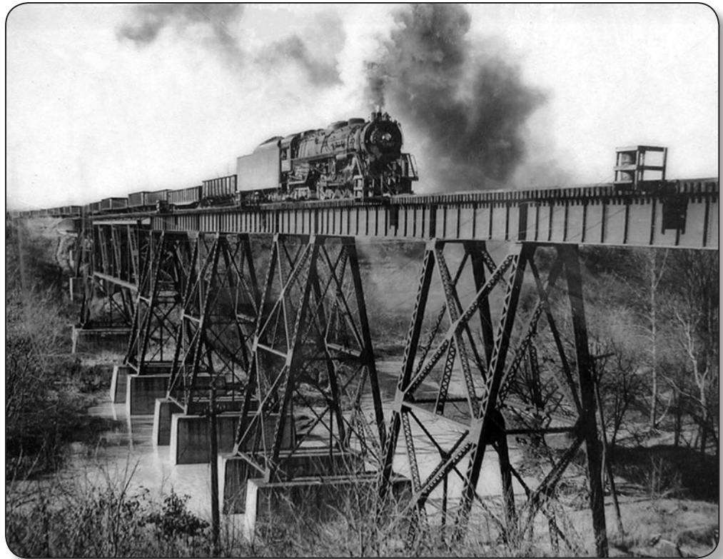
Lorain & West Virginia Railroad steam locomotive crossing the Black River trestle in Sheffield Village, circa 1934

Some service began in 1906 and consisted primarily of coal shipments to the communities of Amherst, Oberlin and Lorain. In 1907 service was completed to the steel mills of the National Tube Company on the Black River, the line’s prime customer. The Wheeling & Lake Erie Railway (W&LE)