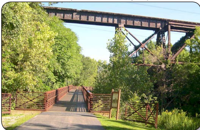
Abandoned Lorain & West Virginia Railroad trestle from Lorain County Metro Park's Bridgeway Trail, 2005