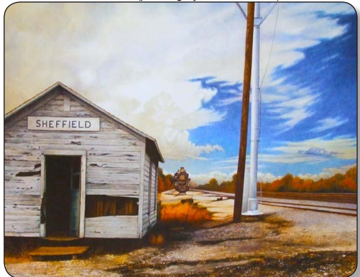
Sheffield line shack on the Nickel Plate Road at Harris Road, circa 1970 (painting by Tim O'Connor)

In 1964 the Nickel Plate Road and several other mid-western carriers were merged into the larger Norfolk and Western Railway (N&W). The goal of the N&W expansion was to form a more competitive and successful system serving 14 states and the Canadian province of Ontario on more than 7,000 miles of rails. The profitable N&W was itself combined with the Southern Railway, another profitable carrier, to the form Norfolk Southern Railway in 1982.