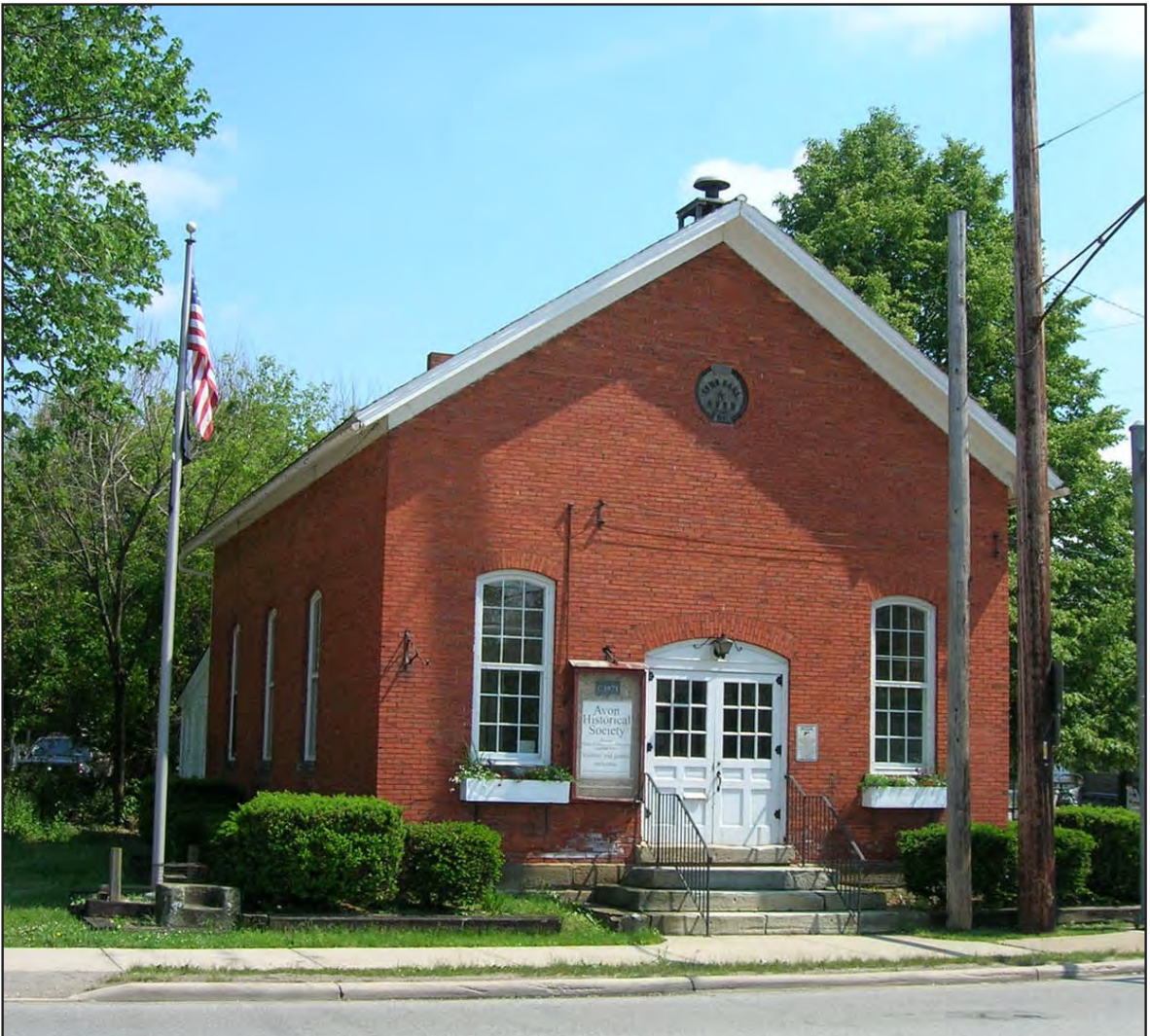
Avon Old Town Hall, built in 1871 in Greek Revival style—36995 Detroit Road.

The Township Trustees purchased the land for the Avon Town Hall from Clemens Alten in 1871 for $400. Bates and Dunning built the town hall in the Italianate style the same year for $800. In the early years, a water well and pump were located in front of the Old Town Hall that local people used for their water supply. The building was next owned by the Village of Avon (incorporated in 1917), and now by the City of Avon (1961). It housed the Avon Public Library starting in 1958 until it became the home of the Avon Historical Society in 1977. The Avon Old Town Hall of 1871 is listed on the Ohio Inventory of Historic Structures (LOR-103-3) and has been designated as a Lorain County Historic Landmark.