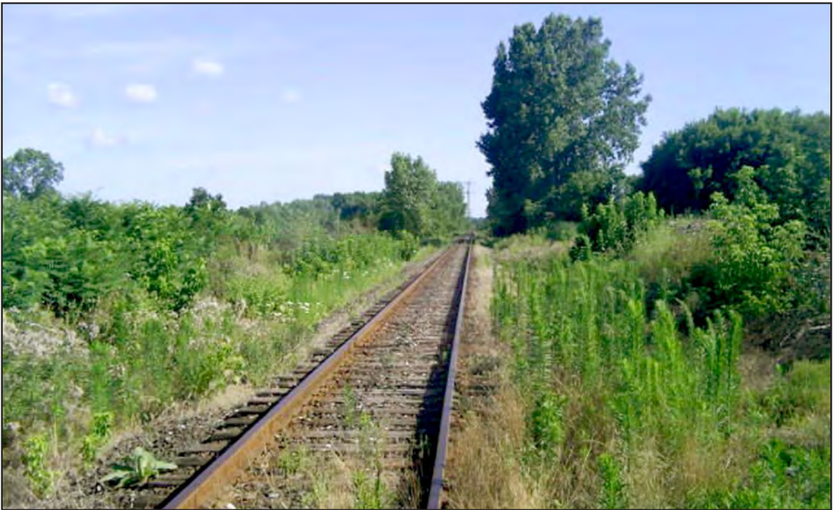
Former Lake Shore & Michigan Southern Railroad tracks, built circa 1890, form the boundary between Sheffield and Avon.