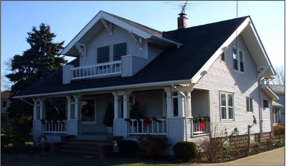
Baeder House, a Sears catalog house built circa 1920—39385 Detroit Road.

This Craftsman Bungalow-style Sears, Roebuck, & Company kit house, The Westly , was built circa 1920. This example is unusual in that the exterior is virtually unchanged since its construction nearly a century ago.