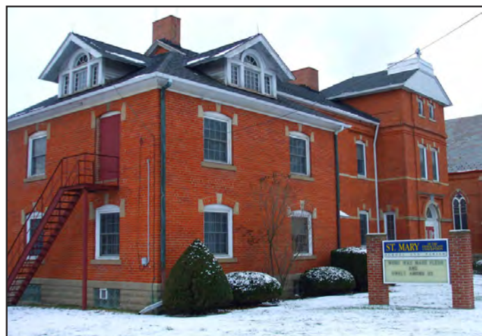
St. Mary School, built 1885—2680 Stoney Ridge Road.

St. Mary Catholic School, begun in 1845, was the first multi-room school in Avon. The current red brick three-story school building was built in 1885 and has been in continuous service for 125 years. The old school has modern technology, including building-wide wireless Internet capability.