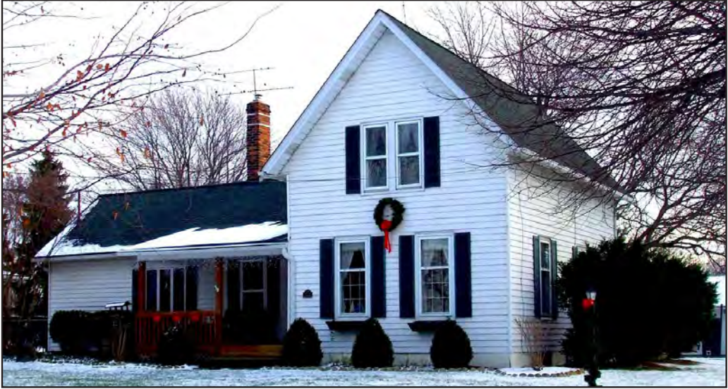
Schmetzer House built in the 1880s—39645 Detroit Road.

This Vernacular/Italianate-style farmhouse, built in the 1880s, adopts the basic “T” design of earlier Greek Revival-style farmhouses, with a two-story main section and one-story wing set at right angle to the gables, but not other elements. The original farm had orchards and vineyards.