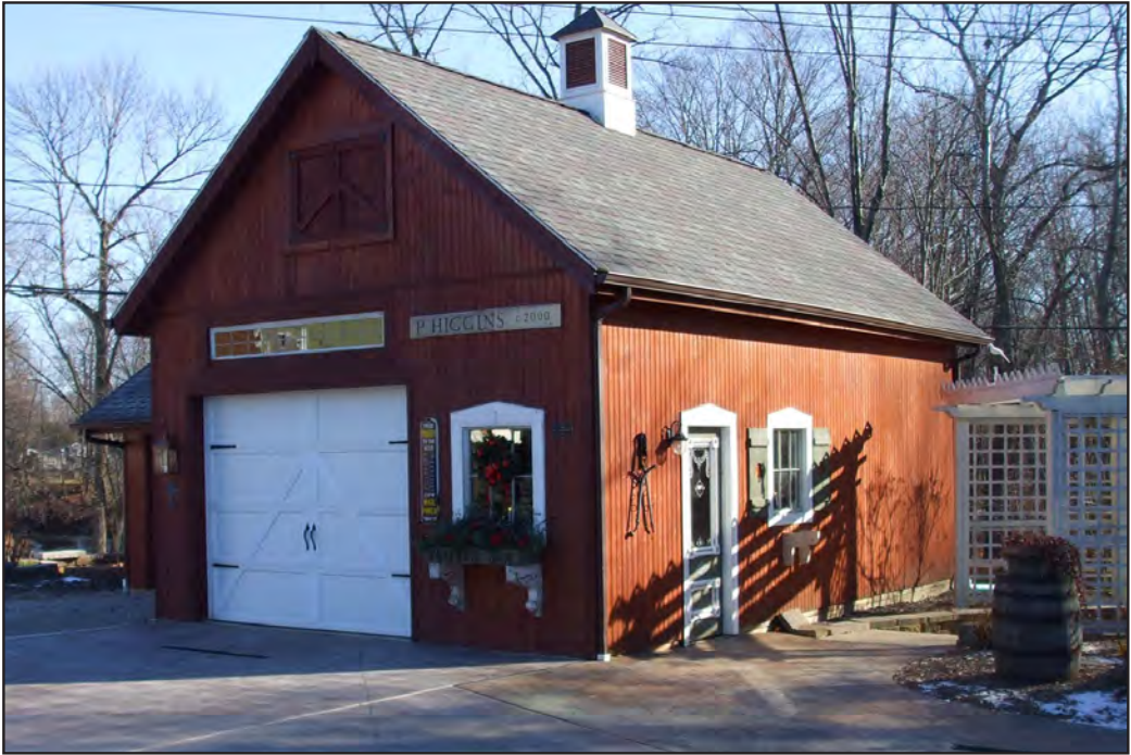
Higgins Barn adjacent to the Milo Williams House, built 2000—37371 Detroit Road.