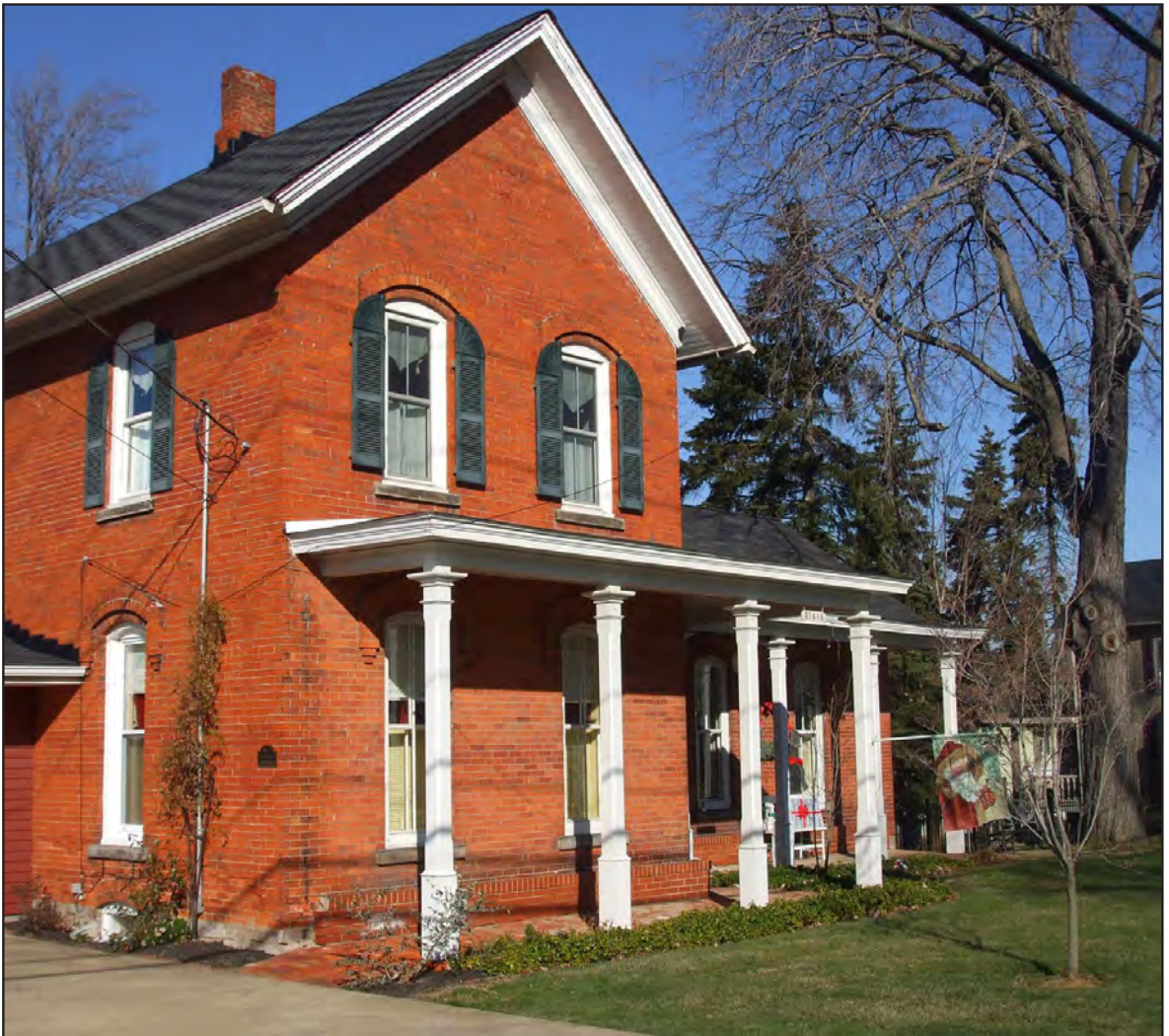
Truman B. Daily House, Italianate-style residence built in 1870—37416 Detroit Road.