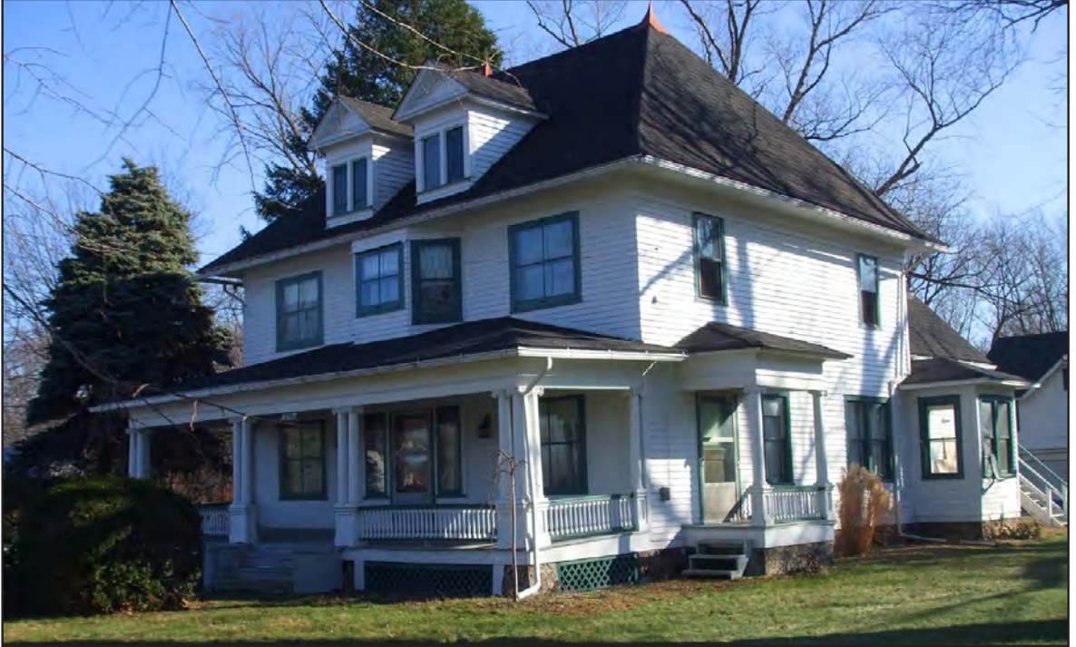
Dr. Pipes House, a Colonial Revival-style house built circa 1900—37399 Detroit Road.