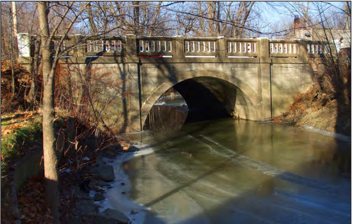
French Creek Bridge in winter—Detroit Road.