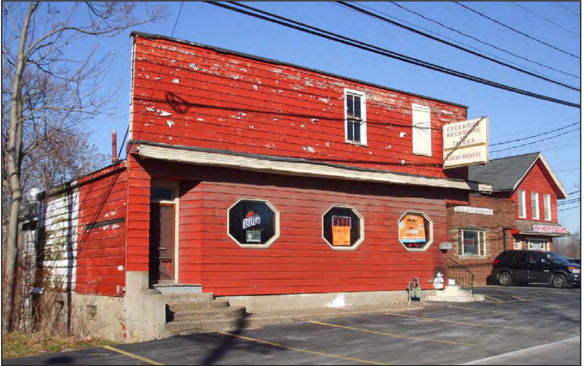
Old French Creek Tavern—37000 Detroit Road.

This commercial building of Colonial Revival style was built circa 1900. Located on the east bank of French Creek, the building houses several businesses, including the Creekside Brewhouse and Tavern and the Blue-Chip Beverage . In the 1950s and 1960s the French Creek Tavern , once located here, enjoyed a reputation as an excellent place to have a Lake Erie yellow perch dinner at a reasonable price.