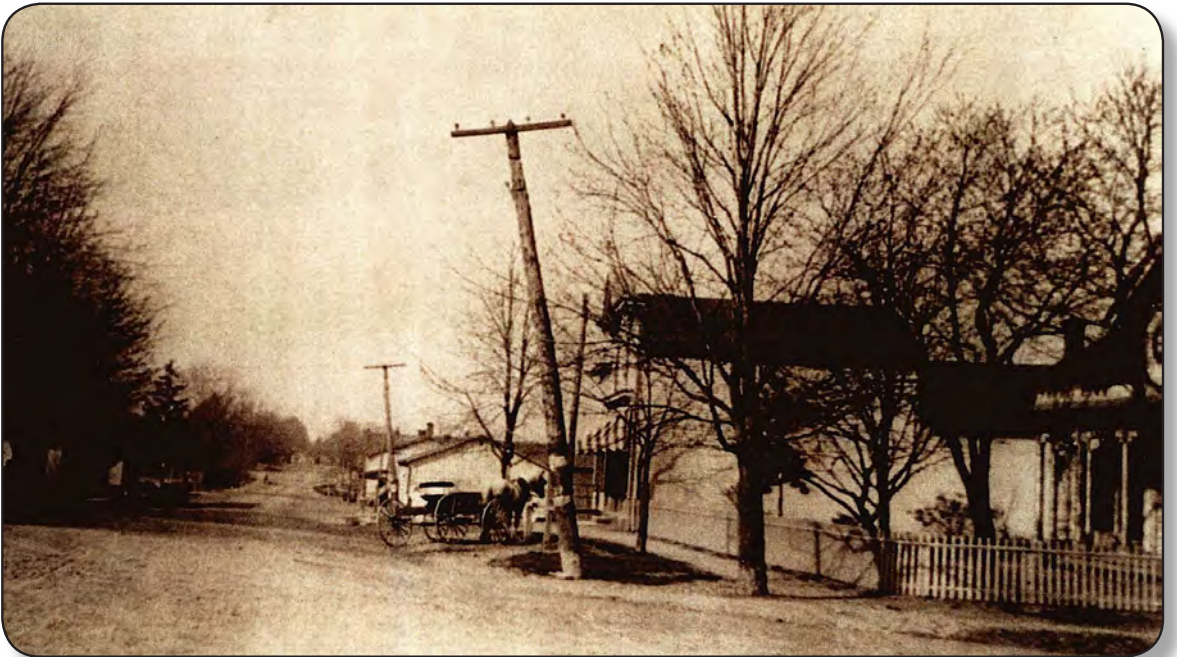
French Creek District in 1890s. View down French Creek Road. The building above is at the far right side of this photograph.