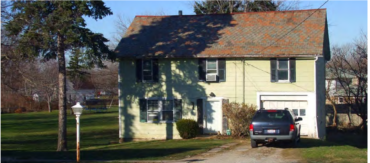
Converted barn built circa 1830s—37384 Detroit Road.

This Vernacular-style home was formerly a barn built in the 1830s. This building exhibits an excellent multi-colored slate roof.