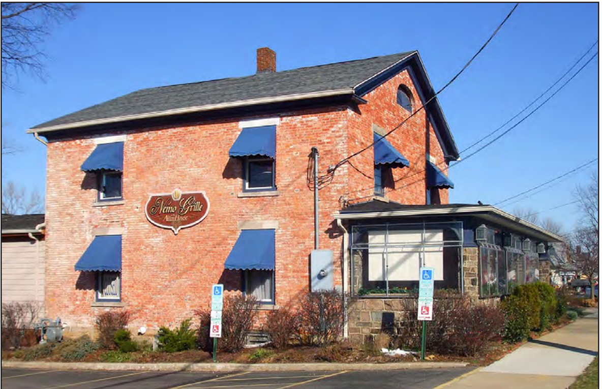
Clemens Alten House, Greek Revival-style home built circa 1830—36976 Detroit Road.

Front view of Clemens Alten House—36976 Detroit Road. The Craftsman-style stone porch was added in the early 20 th century. The material used to construct the porch is field stone composed of “glacial erratic” boulders.