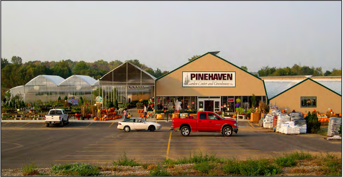
Pinehaven Garden Center—39424 Detroit Road.

The Jensen family converted this former 1-acre tomato-industry greenhouse, on a 10-acre parcel of land on the north slope of North Ridge, to an attractive garden center in 1985. In the following decades they have added several new greenhouses. Annually, Pinehaven grows 65,000 flats of flowers and other plants [2.7 million seedlings], 30,000 garden mums, and 50,000 Christmas poinsettias.