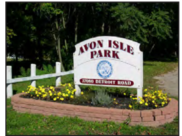
Avon Isle Park—37080 Detroit Road.

Detroit Road to the park and the pavilion. The City also plans to restore the dance pavilion as a civic center for the enjoyment of area residents.