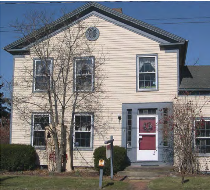
Henry Harrison Williams House as it appeared in 2005.