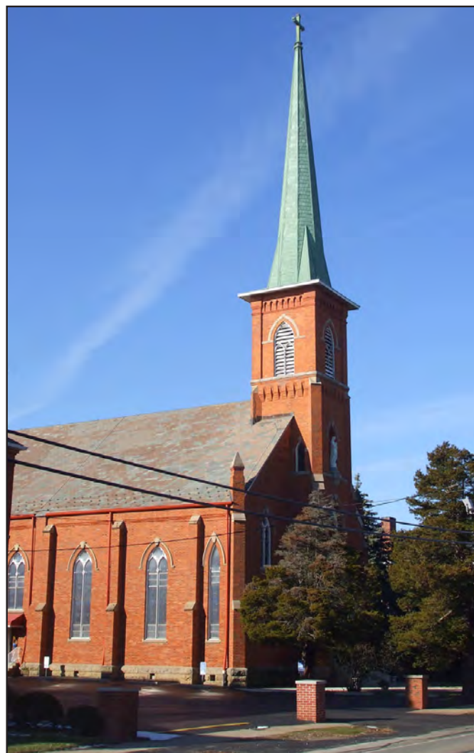
St. Mary of the Immaculate Conception Catholic Church, built 1895—2640 Stoney Ridge Road.

St. Mary Catholic Church and School—2640 & 2680 Stoney Ridge Road. A little farther along, the red brick Gothic Revival-style St. Mary of the Immaculate Conception Catholic Church and the Richardsonian Romanesque-style St. Mary School dominates the western side of the road. Constructed in 1893-1895