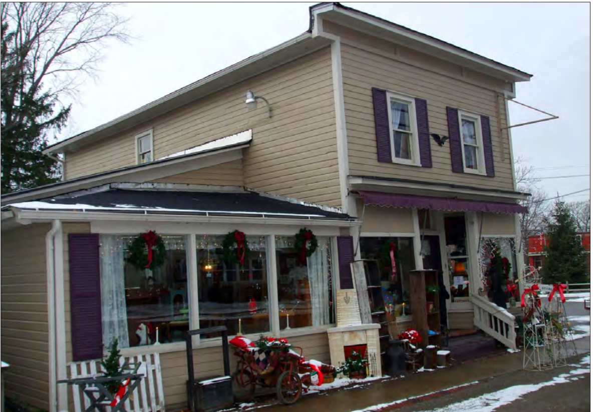
Country Store, Italianate-style shop built in 1890—2536 Stoney Ridge Road.