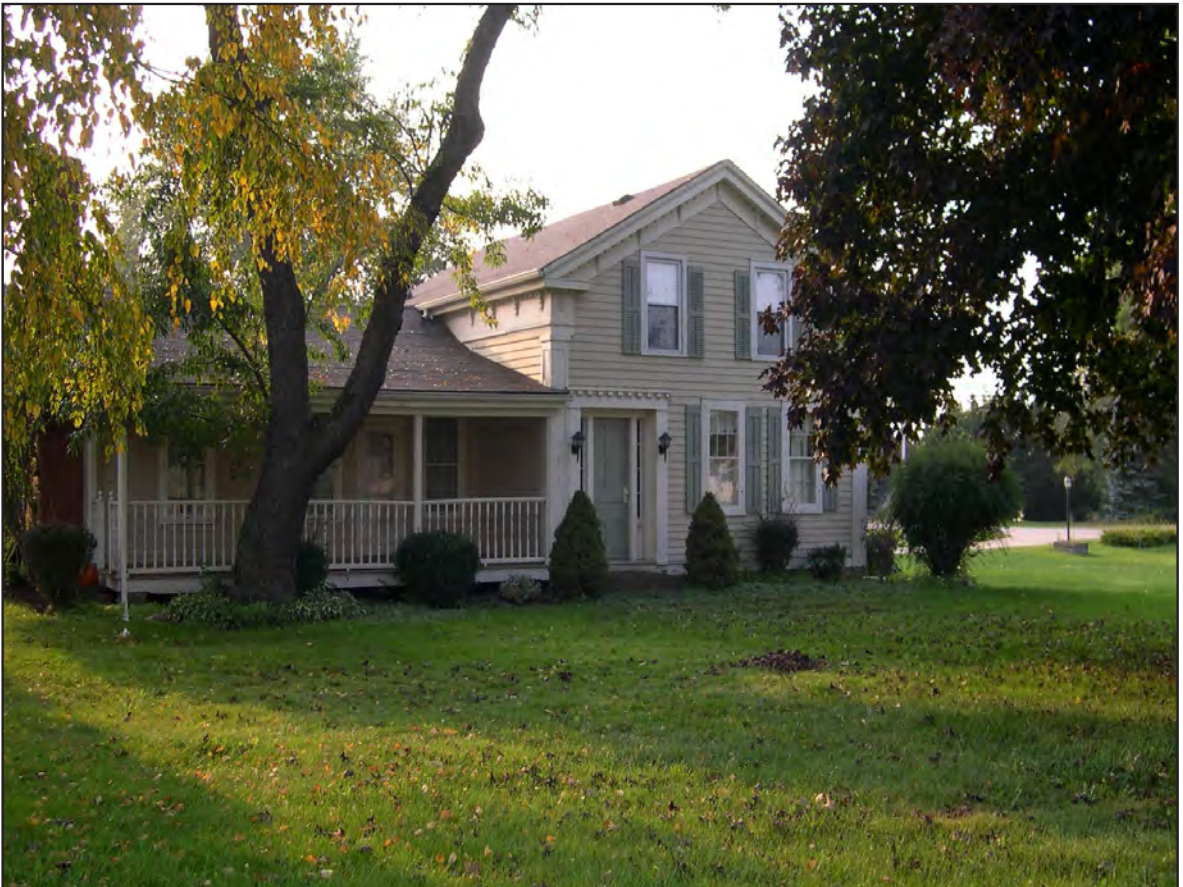
Ezra Jackson House, Greek Revival-style home built by the owner in 1846—39351 Detroit Road.