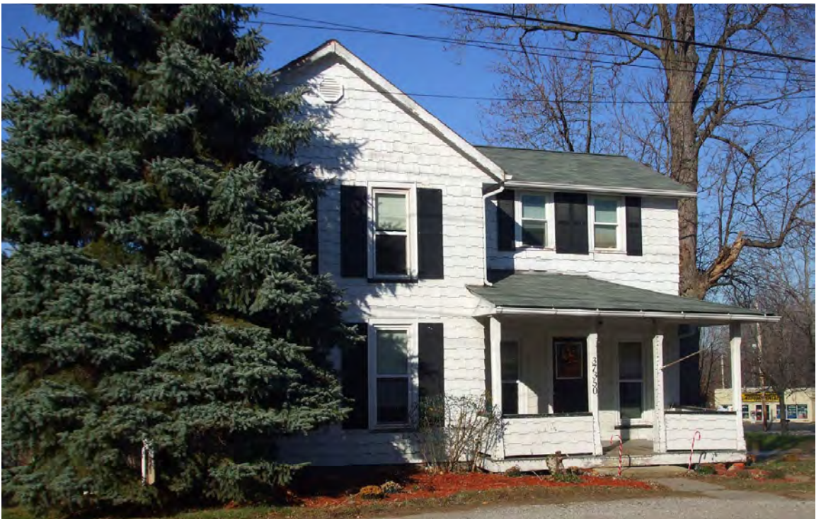
Italianate-style house, built circa 1880s—37350 Detroit Road.

This Italianate-style house was built circa 1880. In recent years the interior of this house was severely damaged by fire and has since been renovated. A country doctor's office was once in the room off the front porch.