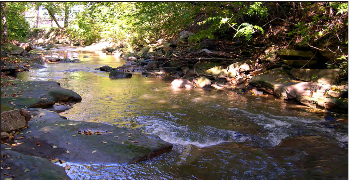
French Creek flowing over outcrop of Berea Sandstone along the west side of the Tavern.