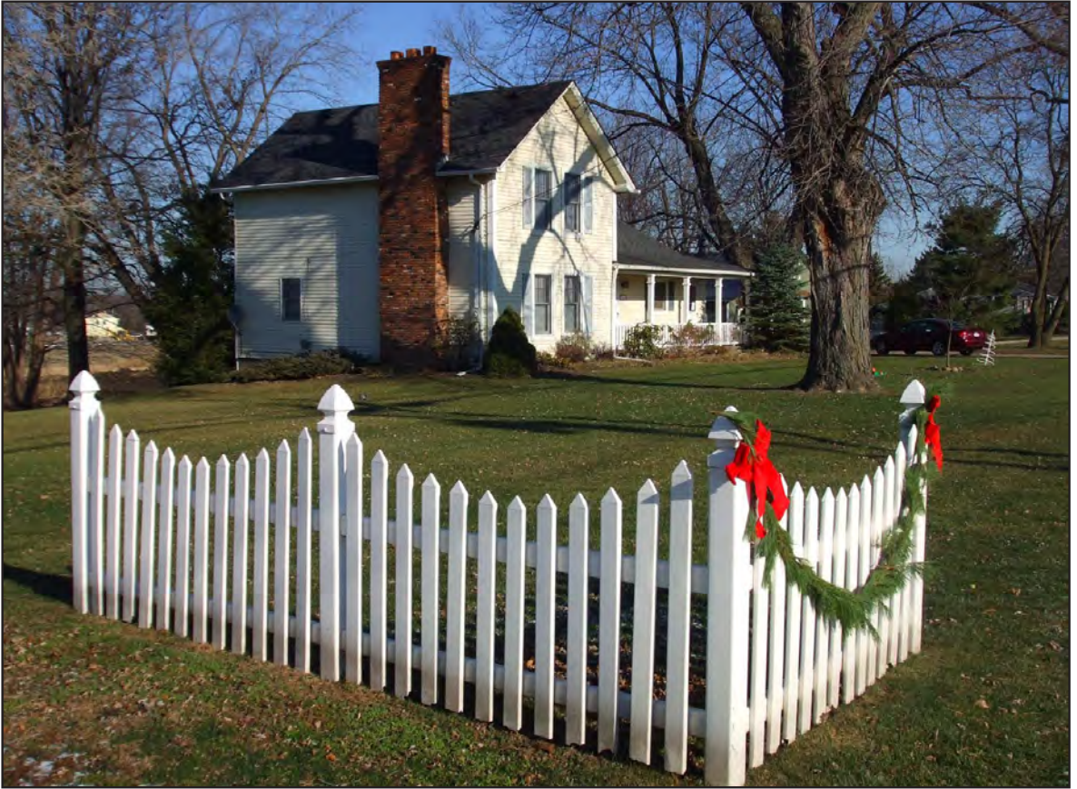
Italianate-style farmhouse built circa 1880-39114 Detroit Road.

This Italianate-style farmhouse was built circa 1880. The adjacent one-story barn also features Italianate-style roof brackets. The barn appears to have received additions to the left and right sides, sometime in the past.