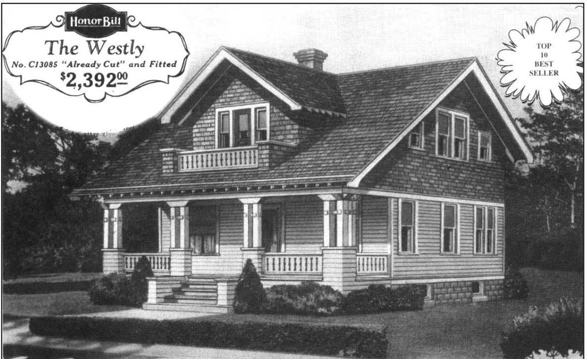
The Westly as advertised in the 1928 Sears, Roebuck & Company catalog.