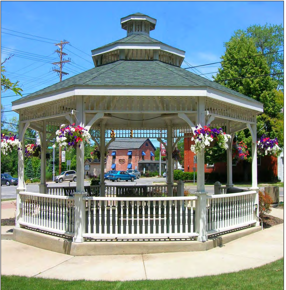
Heritage Square Park gazebo—37001 Detroit Road.

The park also proudly exhibits an Ohio Bicentennial Historic Marker dedicated to the accomplishments of Dr. Norton S. Townshend, a leader in progressive agriculture. The Avon Old Town Hall of 1871, now the home of the Avon Historical Society, is also located at this intersection. A vacant bar that once was a general store stood on at this location before the property was acquired for the park.