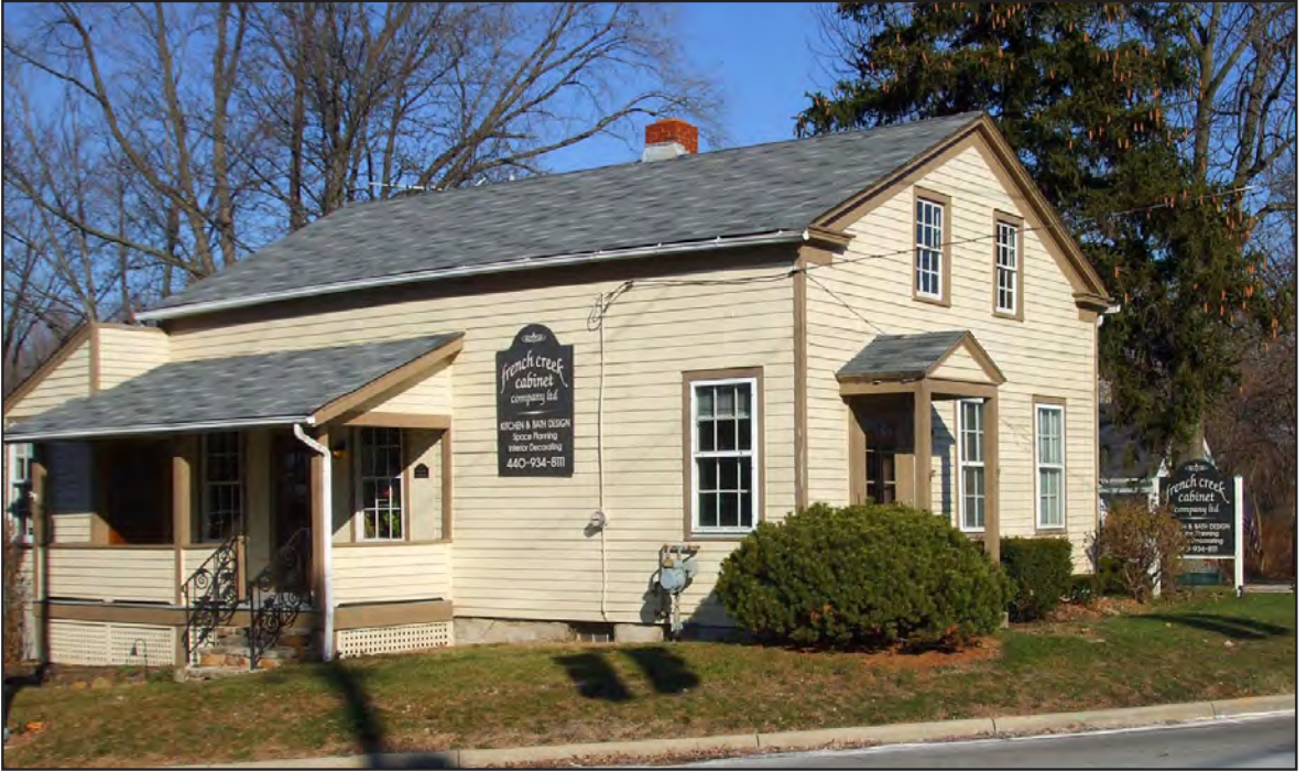
Greek Revival-style former residence built circa 1850—37298 Detroit Road.

This delightful small Greek Revival-style residence, located at the intersection of French Creek Road, was built circa 1850 in the community that was growing around the district where French Creek passes through North Ridge. Note the original “six-over-six” windows. In recent years it has been renovated and now houses the French Creek Cabinet Company .