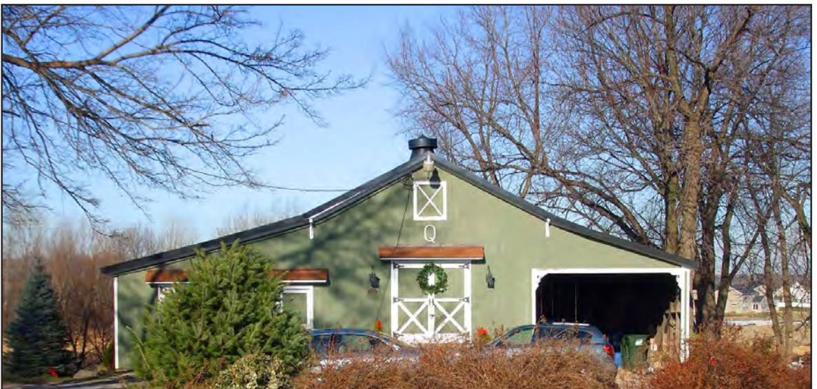
Italianate-style barn—39114 Detroit Road.