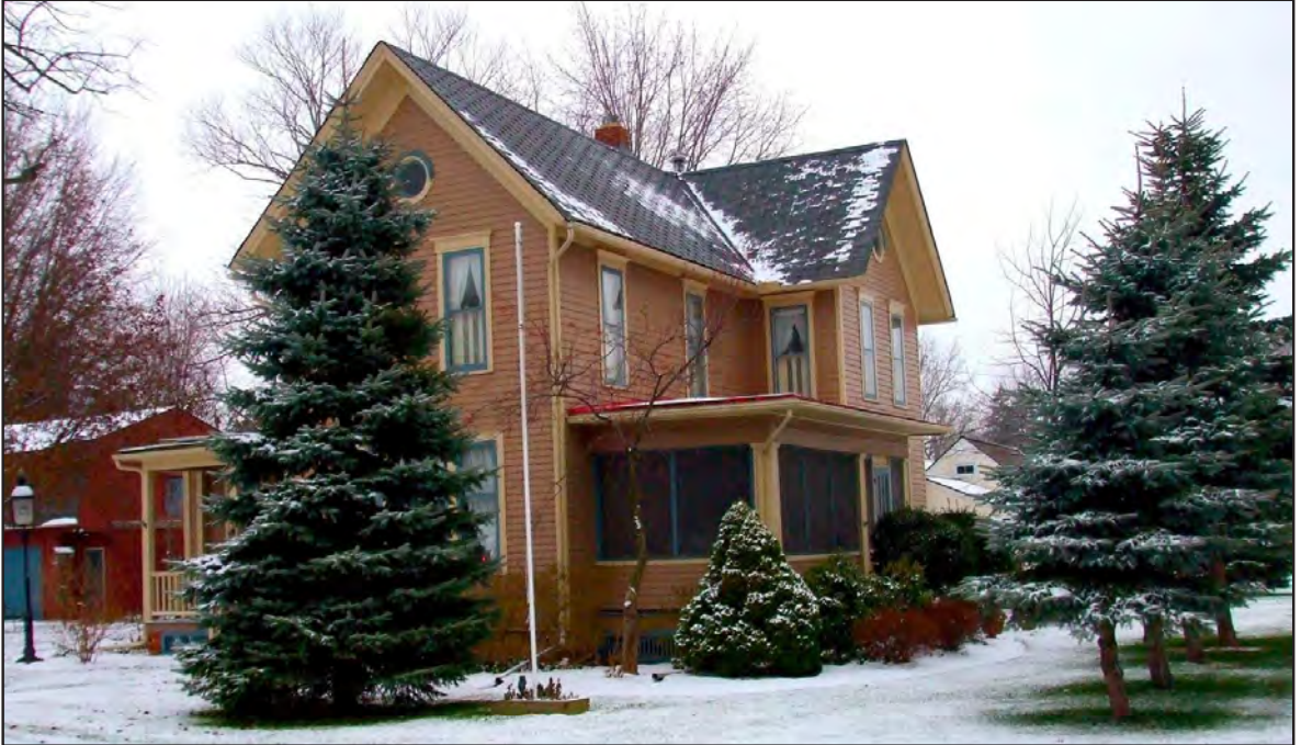
Joseph P. Forthofer House, Italianate-style home built circa 1880—37511 Detroit Road.

This Italianate-style house was built circa 1880. Noteworthy features of this two-story house include window trim and circular windows in the front and side gables. The porches were probably later additions and not enclosed.