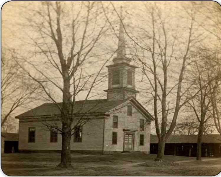
Avon Baptist Church as it appeared in 1910, note horse barns at rear and side of the church.

Avon Baptist Church—2575 Stoney Ridge Road. Shortly after turning south on Stoney Ridge Road the impressive high spire and striking white exterior of the of the Avon Baptist Church can be seen on the east side of the road. Built circa 1839, this is the oldest church in Avon and has been in continuous service for some 170 years. The congregation was founded in 1817 by a small group of worshipers meeting at the home of Wilbur Cahoon and various other places in Avon until the land for the present church was purchased for $40 in 1839 and the sanctuary that still stands was constructed.