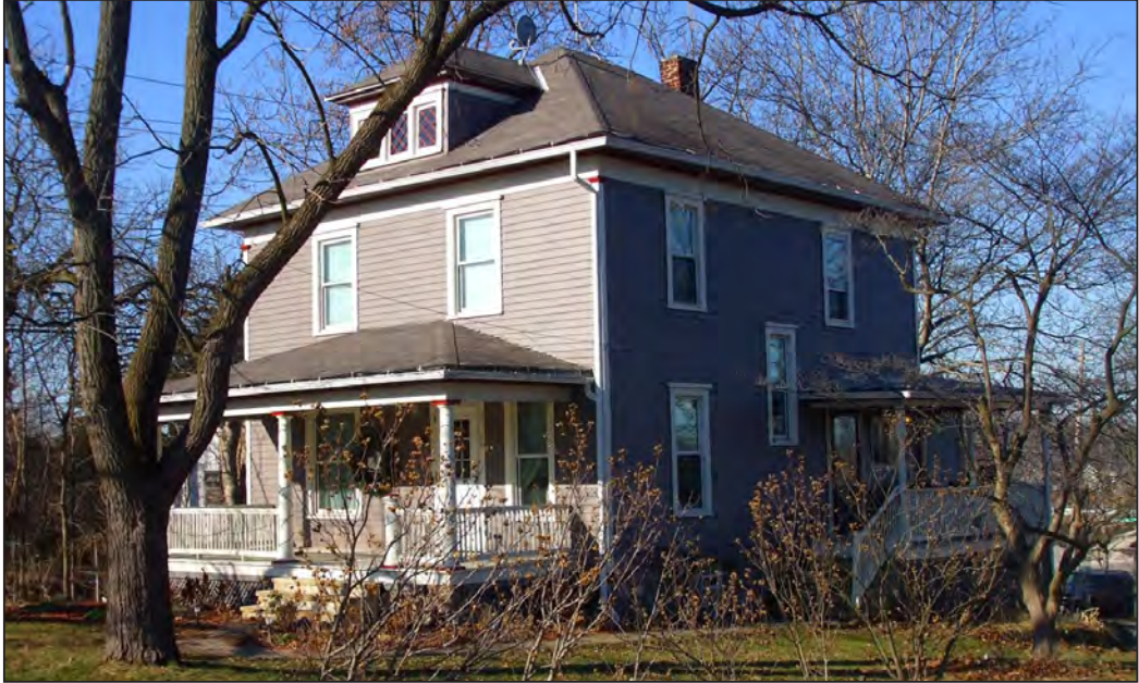
Colonial-Revival-style farmhouse built circa 1900—38960 Detroit Road.

This large Colonial Revival-style farmhouse was built circa 1900. It features a full porch across the front and a half porch on the east side. The hip roof exhibits a small front dormer at the attic level, with diagonal lattice muntins. Cobblestone pillars, constructed by noted paleontologist Peter Bungart, mark the front corners of the property.