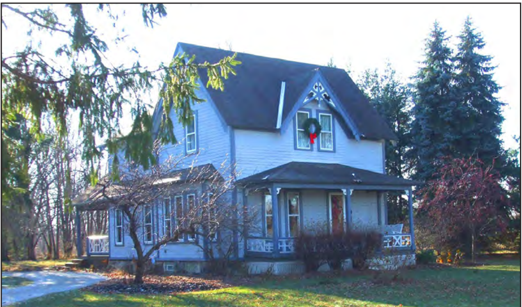
Malone House built in the 1880s—39424 Detroit Road.

This Italianate-style farmhouse, with decorative elements of Eastlake-style on the porch supports and at the peak of the front gable, was built in the 1880s.