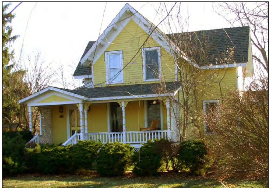
Middlestead House built circa 1880—38901 Detroit Road.

This Italianate-style farmhouse was built circa 1880. The elaborate front porch and prominent roof brackets on the gables are the outstanding exterior features of this house. The bisection of two segments of this house with matching gable heights is unusual in this area.