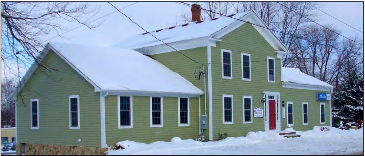
Henry Harrison Williams House, built 1836—37300 Detroit Road.