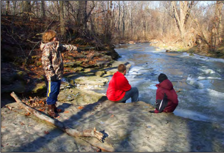
French Creek at Avon Isle Park in winter, note fossilized ripple marks in sandstone outcrop.

Avon Isle was a popular dance pavilion from the 1920s to the 1970s where a wide variety of civic and social events were held. Residents of Avon and Sheffield who attended dances and other events there over 50 years ago recall a colorful history and unique meeting place for men and woman of diverse cultural backgrounds. Local groups used Avon Isle for quilting bees, dances, picnics, clambakes, and volunteer activities for the war effort. Since the cities of Lorain and Elyria had banned dancing on Sundays, frustrated residents flocked to the Avon Isle to dance to the sounds of the big bands, including Guy Lombardo. In later years, amateur and professional boxing matches, such as the Golden Gloves, were held at Avon Isle. The City of Avon has recently received a grant to rebuild the bridge over French Creek that connects