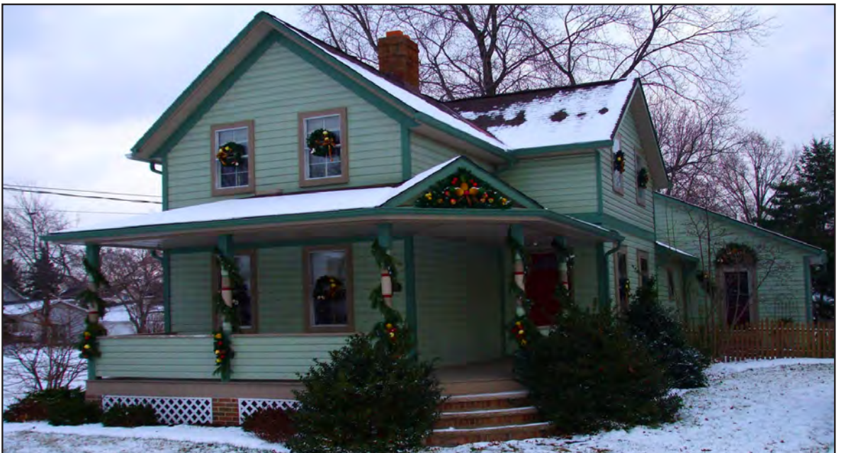
Italianate/Vernacular-style residence built circa 1900—2623 Stoney Ridge Road.

Szippl House—2623 Stoney Ridge Road. On the east side of the road, this nicely decorated Italianate/Vernacular-style home was built circa 1900. The triangular gable over the corner porch is an outstanding feature of this house.