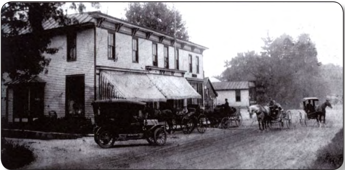
Weiler's Department Store, Italianate-style building built in 1879—37079 Detroit Road.