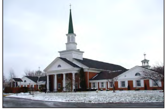
Avon United Methodist Church, built 1960 in Neoclassical style—37711 Detroit Road.

Avon United Methodist Church was organized in 1820. Served by circuit-riding preachers, the congregation met in a log schoolhouse until 1826. They then built their own meeting house, which was used until 1834 when the first wood-frame Methodist Episcopal Church was built in 1855 at a cost of $500. This church burned down in 1910. The following year they built a new building [now the Avon Church of God at 37445 Detroit Road], which served the congregation until 1960 when their current Neoclassical-style brick church was completed. This new church sits on an 11-acre parcel just west of the new Avon High School. A classroom and fellowship hall were added the flanks of the main sanctuary in 2000. A barn and pavilion on the property are used for retreats and meetings by many community organizations.