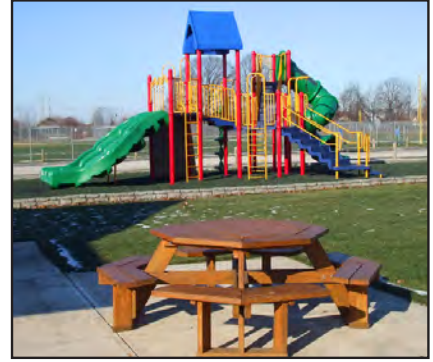
Veterans Memorial Park playground.