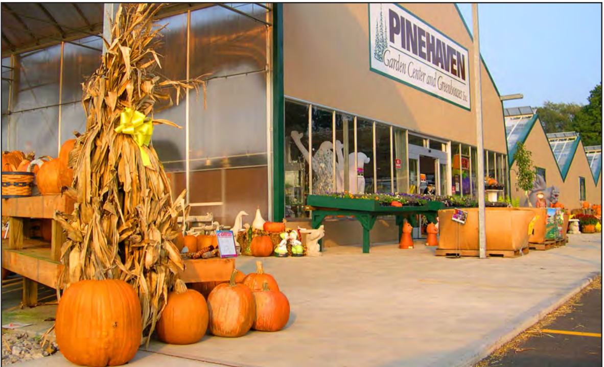
Pinehaven greenhouses grow 65,000 flats of plants each year.