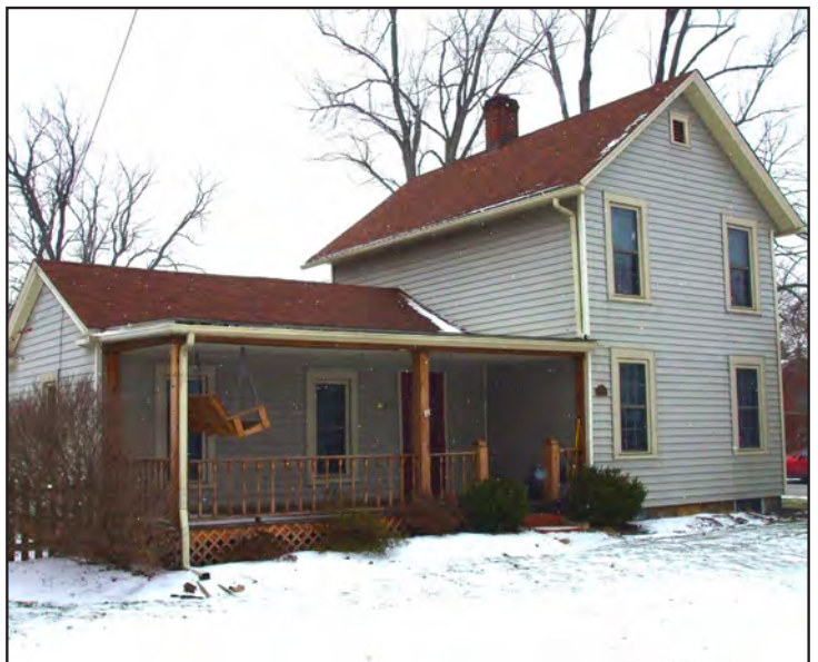
Barrett House built in 1876—37485 Detroit Road.