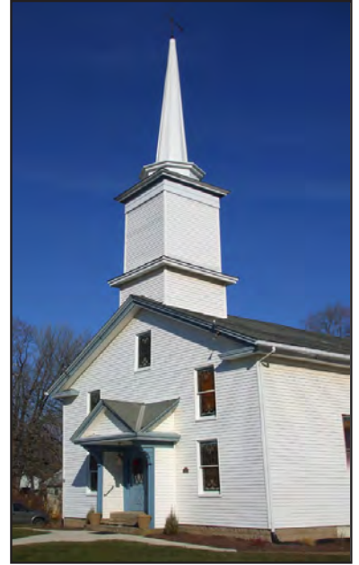
Avon Baptist Church, built 1839—2575 Stoney Ridge Road.

Szippl House—2623 Stoney Ridge Road. On the east side of the road, this nicely decorated Italianate/Vernacular-style home was built circa 1900. The triangular gable over the corner porch is an outstanding feature of this house.