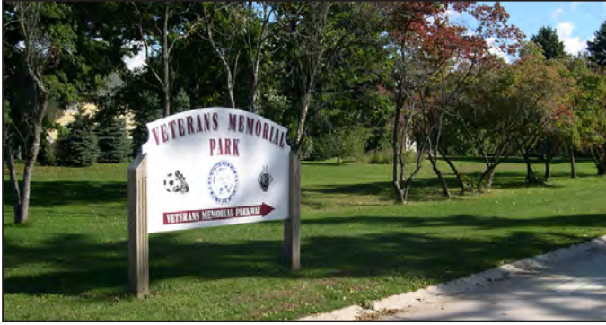
Veterans Memorial Park—38801 Detroit Road.

Avon's Veterans Memorial Park is located on the south side of the Ridge just east of Moon Road. Agricultural lands, including the landscape gardens of Willoway Nurseries , flank a parkway that leads to athletic fields and a playground. Avon boasts two golf courses along the Scenic Byway that are located on the Ridge— Avondale Golf Course (Mile Point 4.0) on the west side of the community and Avon Oaks County Club (Mile Point 8.7) on the east side.