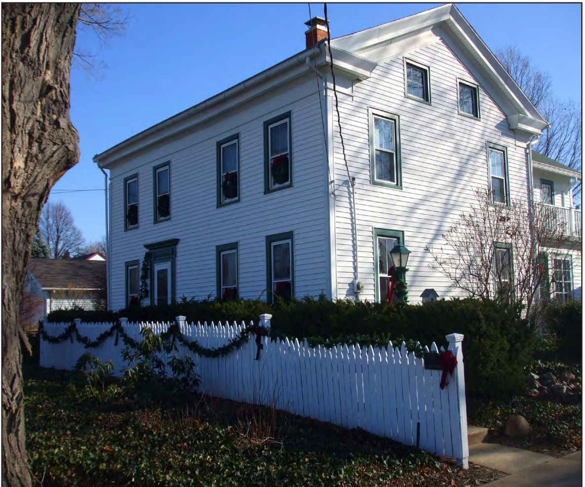
Ora Butler Cahoon House, Greek Revival-style home built in 1845—37821 Detroit Road.