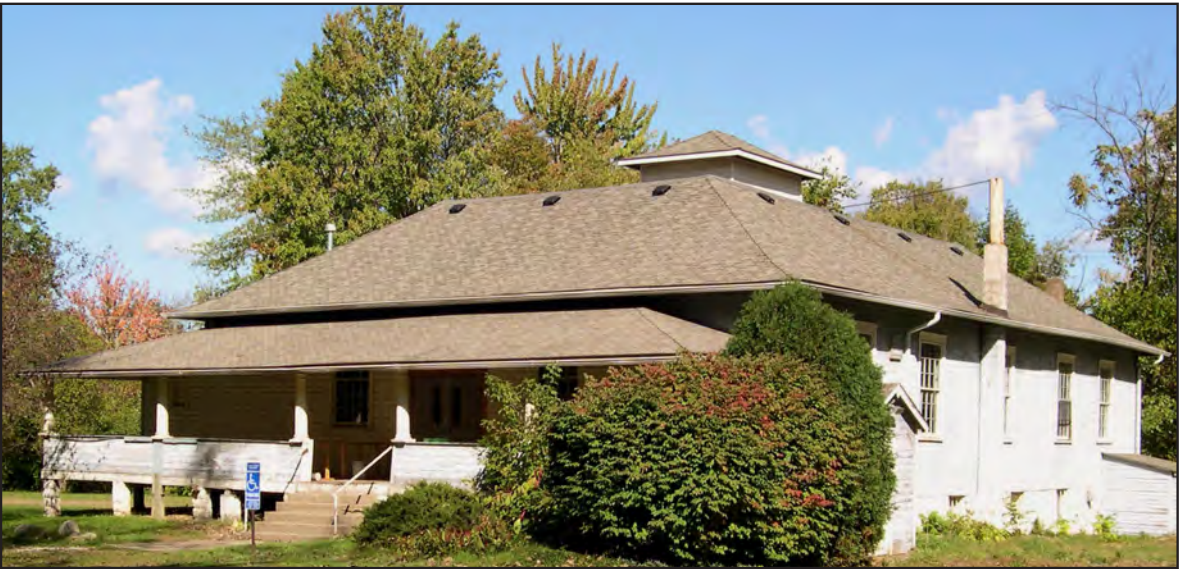
Avon Isle Dance Pavilion, built in 1926.

A historic 50-by-70-foot dance pavilion highlights this city park. The pavilion is a charming blend of Neoclassical and Italian Revival styles. The low hip roof also suggests the influence of the Prairie architectural style. With few exceptions, the exterior and interior of the building are remarkably unchanged from their original construction. A cupola is centrally located on the roof that possesses operable windows for ventilation and natural lighting. A porch extends across the entire length of the façade, about five feet above ground level, and features Doric columns that support the hip roof. The pavilion was constructed in the mid-1920s by F. J. Roth in conjunction with the Knights of St. John. French Creek meanders through, and nearly encircles, the wooded park as it flows over gentle riffles created by the Berea Sandstone bedrock. These rocks were deposited as sand beds in an ancient Paleozoic sea some 350 million years ago.