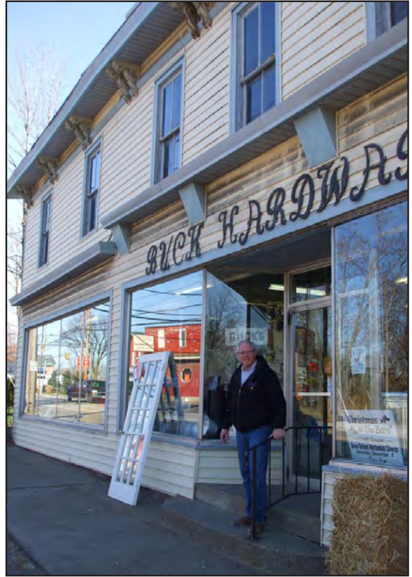
Buck Hardware now occupies the old Weiler's Department Store building.

An elaborate wood cornice, with a series of double brackets, rises up to conceal the slightly pitched roof behind and forms the focal point for the long unified façade. The central portion is the original building with two side wings added later in the same style. At one time a portion of the second floor was used as classrooms—chalkboards are still in place. The 130-year-old building is listed on the Ohio Inventory of Historic Structures (LOR-93-3).