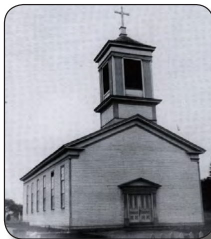
St. Mary Church of 1841 (courtesy of Avon Historical Society).