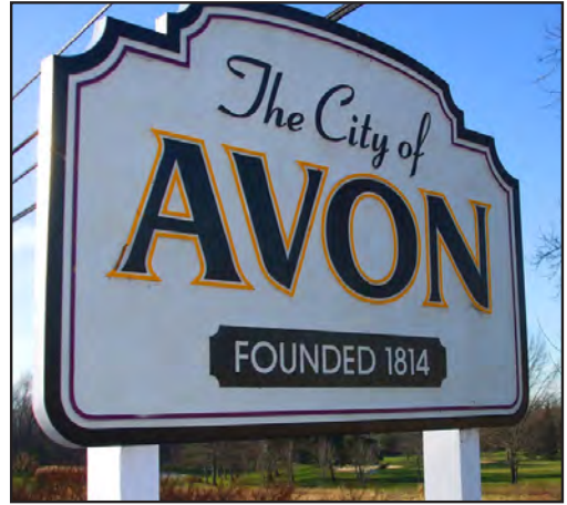
These Welcome Signs greet travelers entering and exiting these North Ridge communities.