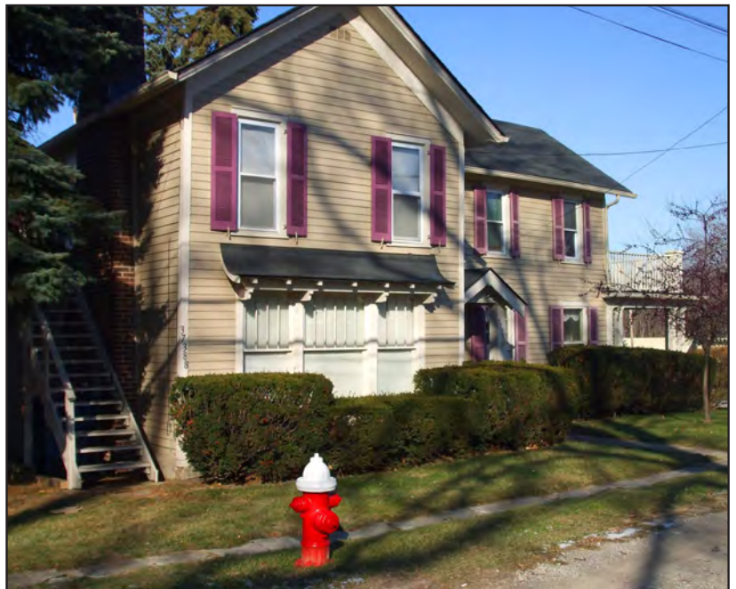
Benham House built circa 1880—37388 Detroit Road.

This Italianate-style house was built circa 1880. An unusual feature is the narrow curved roof and arched brackets protecting a large front window, probably a later modification during the Arts & Crafts Movement (1900-1940).