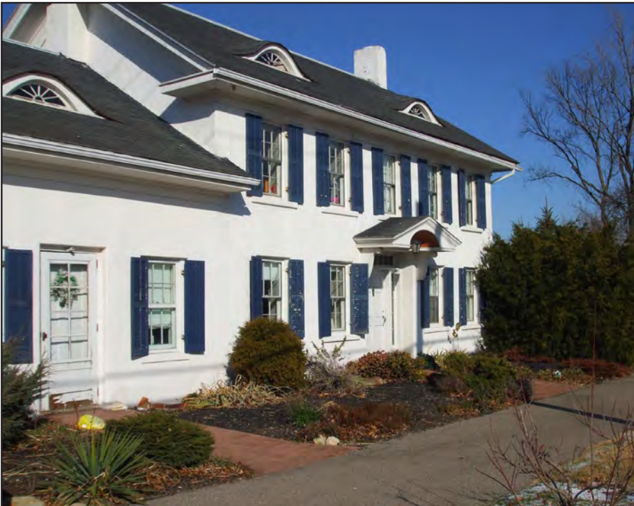
Rak House, Greek Revival-style home was built in 1850—37546 Detroit Road. The original construction was exposed brick that was later covered with stucco.

This Greek Revival-style home was built close to the roadway in 1850. Unique features of this white-painted brick house are the semi-circular roof windows on both the one- and two-story portions of the house. These dormer-like windows, of Georgian style, were probably later additions.