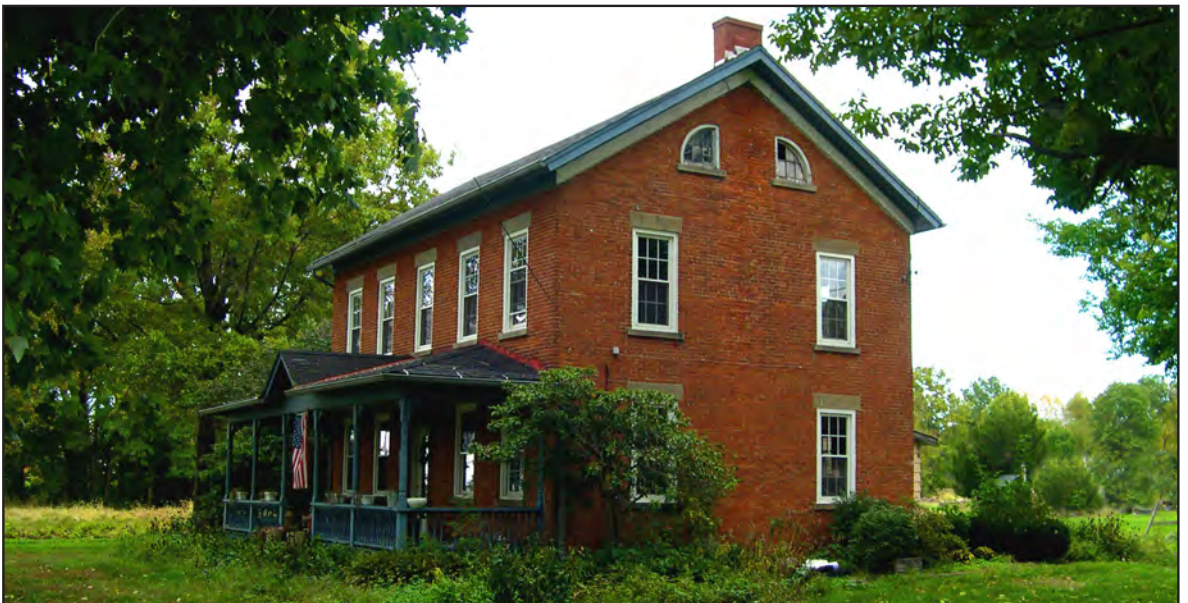
William Rink House, Greek Revival-style farmhouse built in 1840—38181 Detroit Road.

This 1840 Greek Revival-style, brick farmhouse is located at the southeast corner of Detroit and Long Roads. The house features quarter circle windows in the gables. Window openings have plain sandstone lintels. The chimney on the west gable most likely had a matching symmetrical chimney on the east gable at one time. The interior of the house features a brick, vaulted wine cellar. William Rink is known to have owned the house in 1874, and at one time Long Road was known as Rink Road.