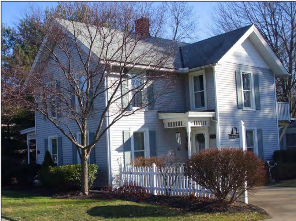
William H. Bommer House—37375 Detroit Road.