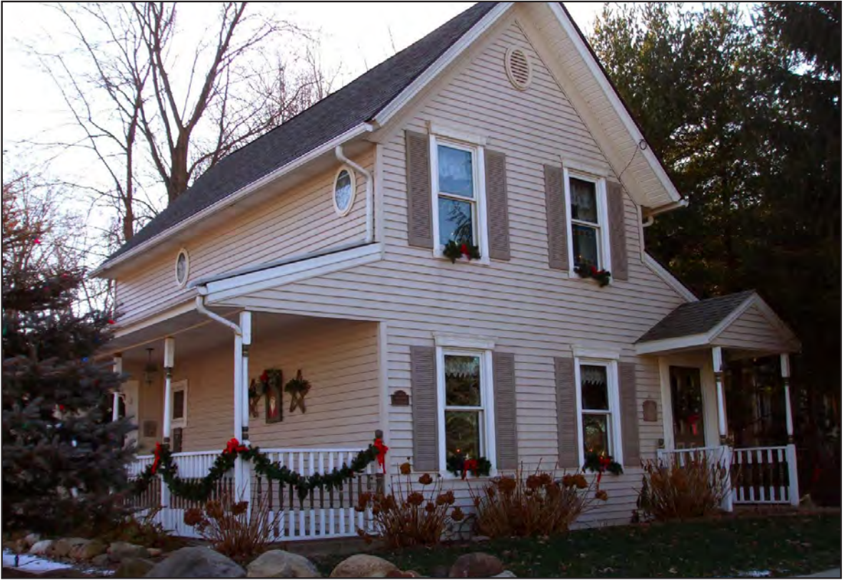
Milo Williams House built circa 1880—37371 Detroit Road.

This Italianate-style house is one of several homes of this style built in the French Creek District of Avon in the 1880s.